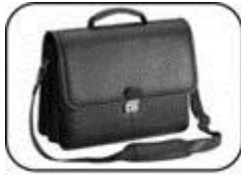
A. leather bag

Q1. Which of these objects is most likely to be attracted to a magnet?