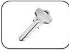
B. metal key