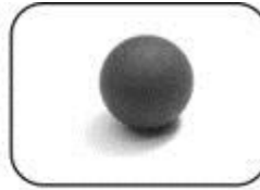
D. rubber ball

Q2. Two magnets when brought together, repel (push) each other. Which of these possibly explains why this happens?