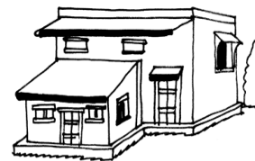
5. a _____ house