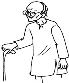
1. an _____ man