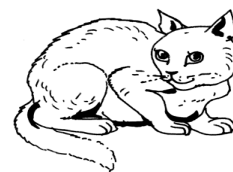
6. a _____ cat