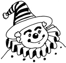
2. a _____ clown